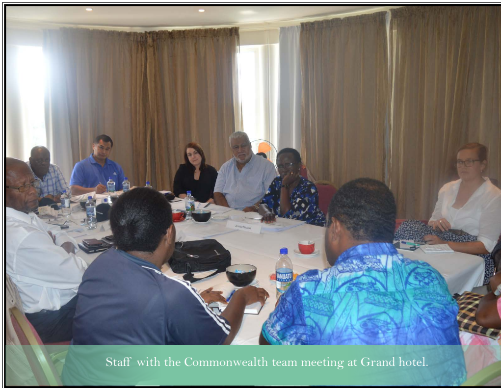
Staff with the Commonwealth team meeting at Grand hotel.

The Youth and Commonwealth Observers Meeting was held on the 19th of January at the Grand Hotel.