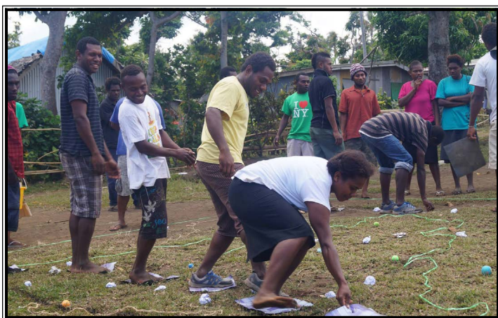
TAFEA Youth participants in a PSS Activity

More than 350 youths throughout Vanuatu were trained in Child protection (CP) responses and psychosocial support (PSS) training. The PSS project coordinator,