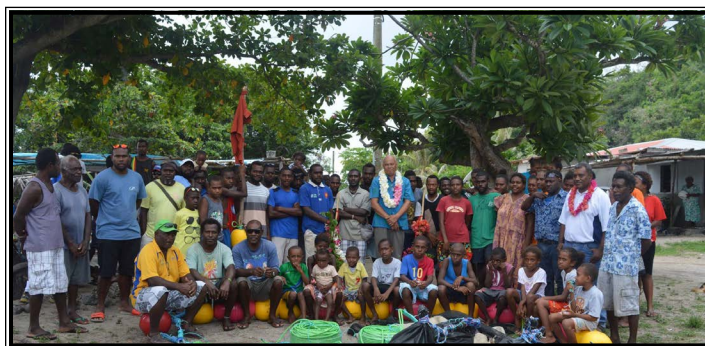
Rongorongowia youth group in a group photo with Pacific Community's DG -Dr.Tukuitonga

VNYC Media is aware that the Fish@Work project will do roll