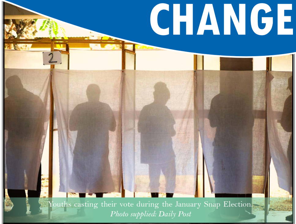
Youths casting their vote during the January Snap Election.

"Coming together is a beginning; keeping together is progress; working together is success."