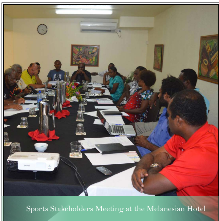
Sports Stakeholders Meeting at the Melanesian Hotel

We still have a lot of registration forms to enter into our data system and of course numbers of active youth group will surely change. Otherwise, Data entry and registration is still ongoing