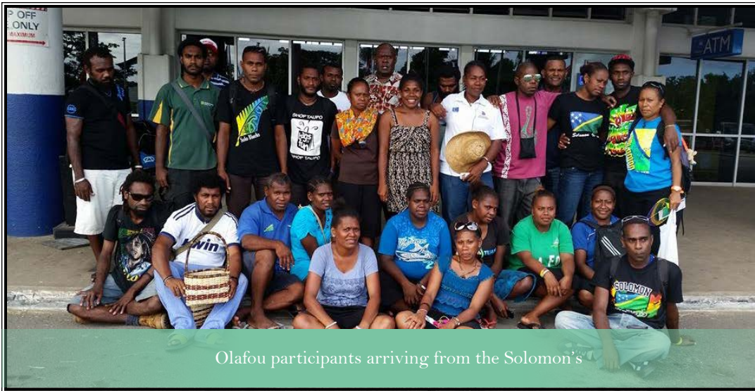
Ola Fou participants arriving from the Solomon's