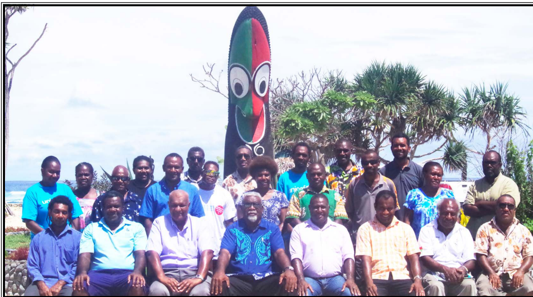
Retreat Group photo with Minister Taiwia

During the course of the one week retreat, all staff of the Department, National Youth Council, Sports Commission, Sports for Development and Sports development have presented their 2015 reports. Provincial Youth and Sports